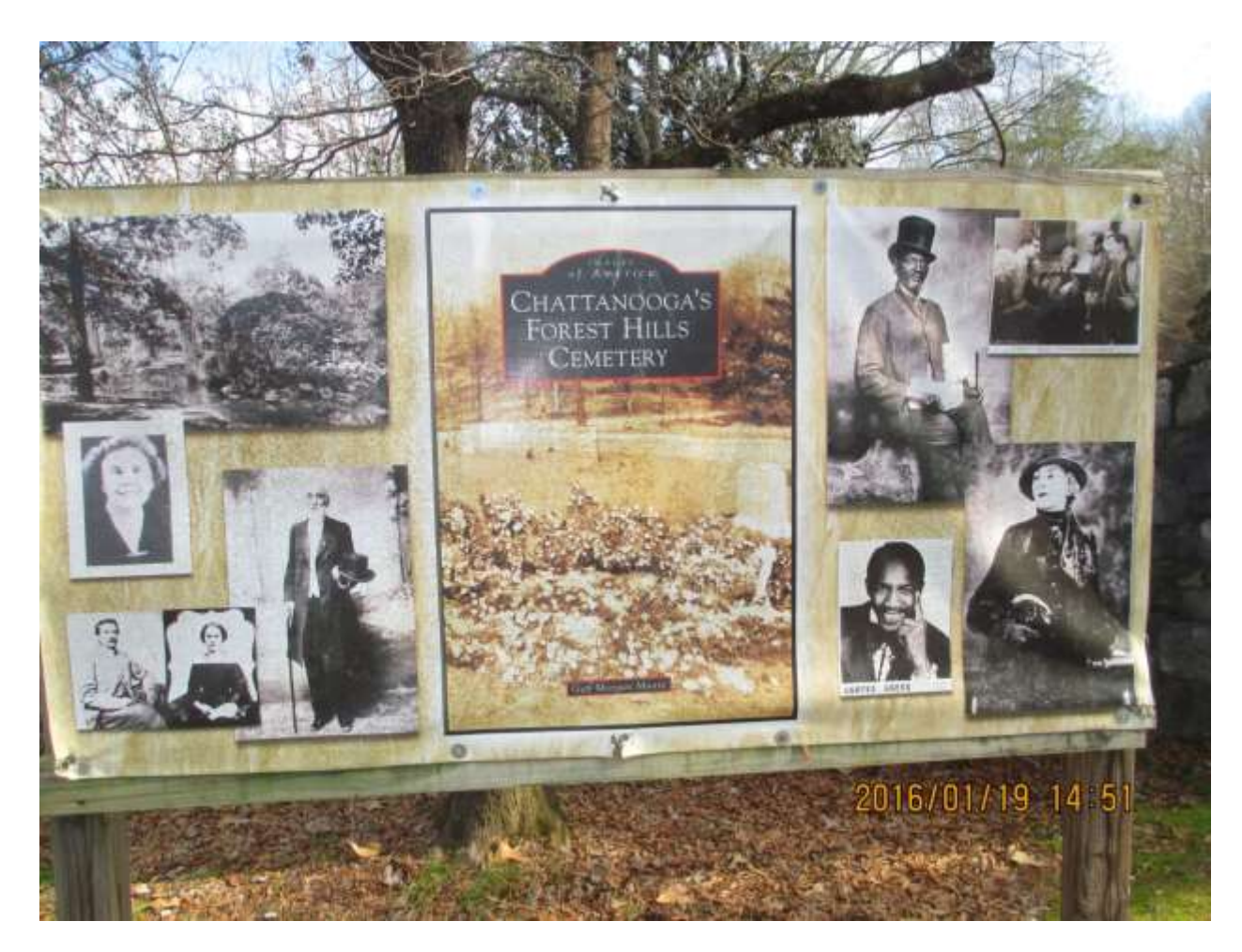
Chattanooga's Forest Hills Cemetery